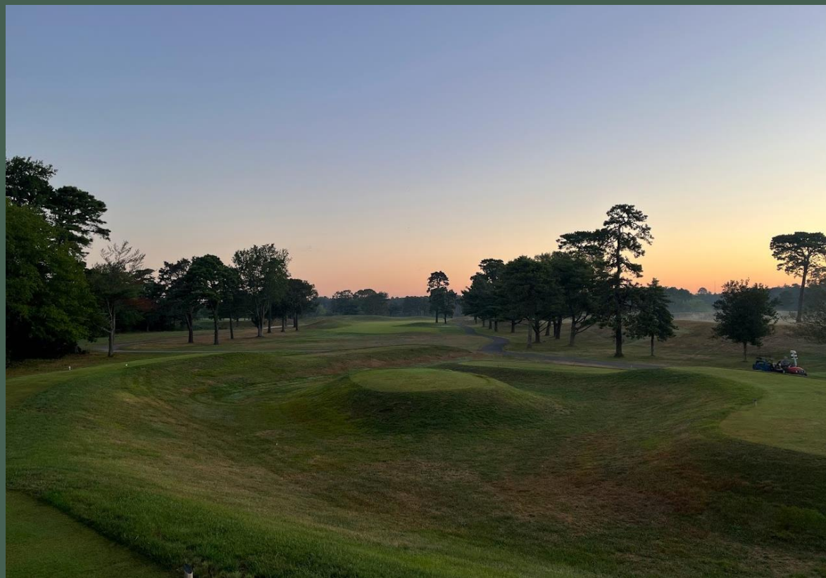
#1 Tee- July 2022