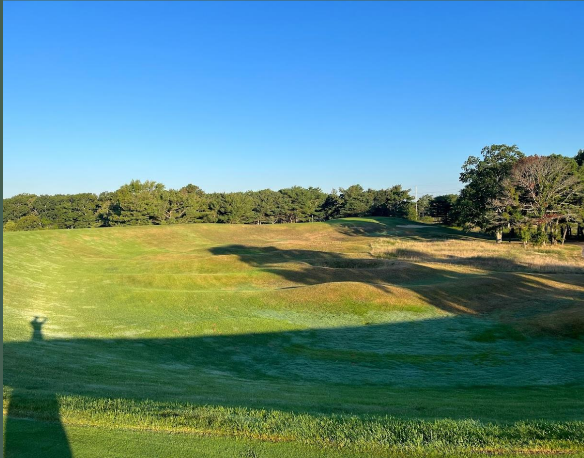
#4 waste area- 2022