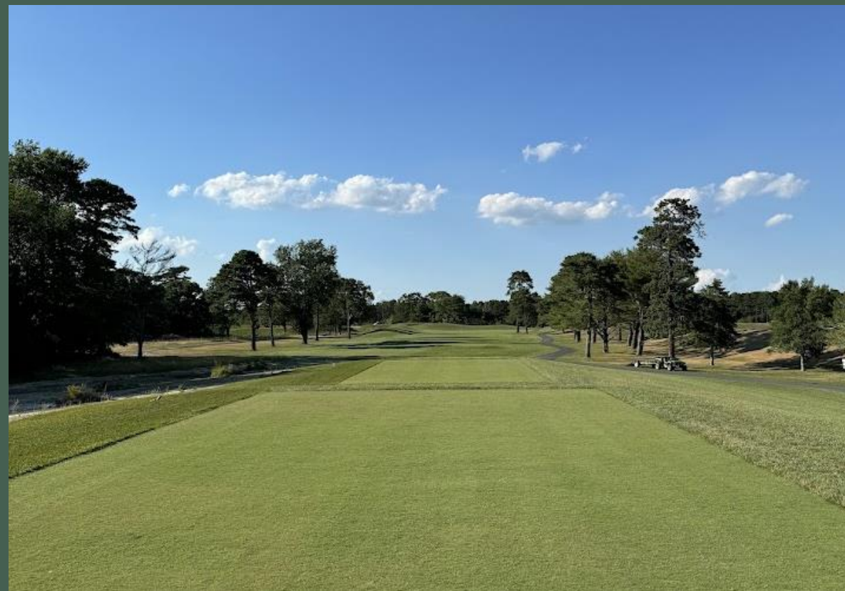
#1 Tee- July 2024