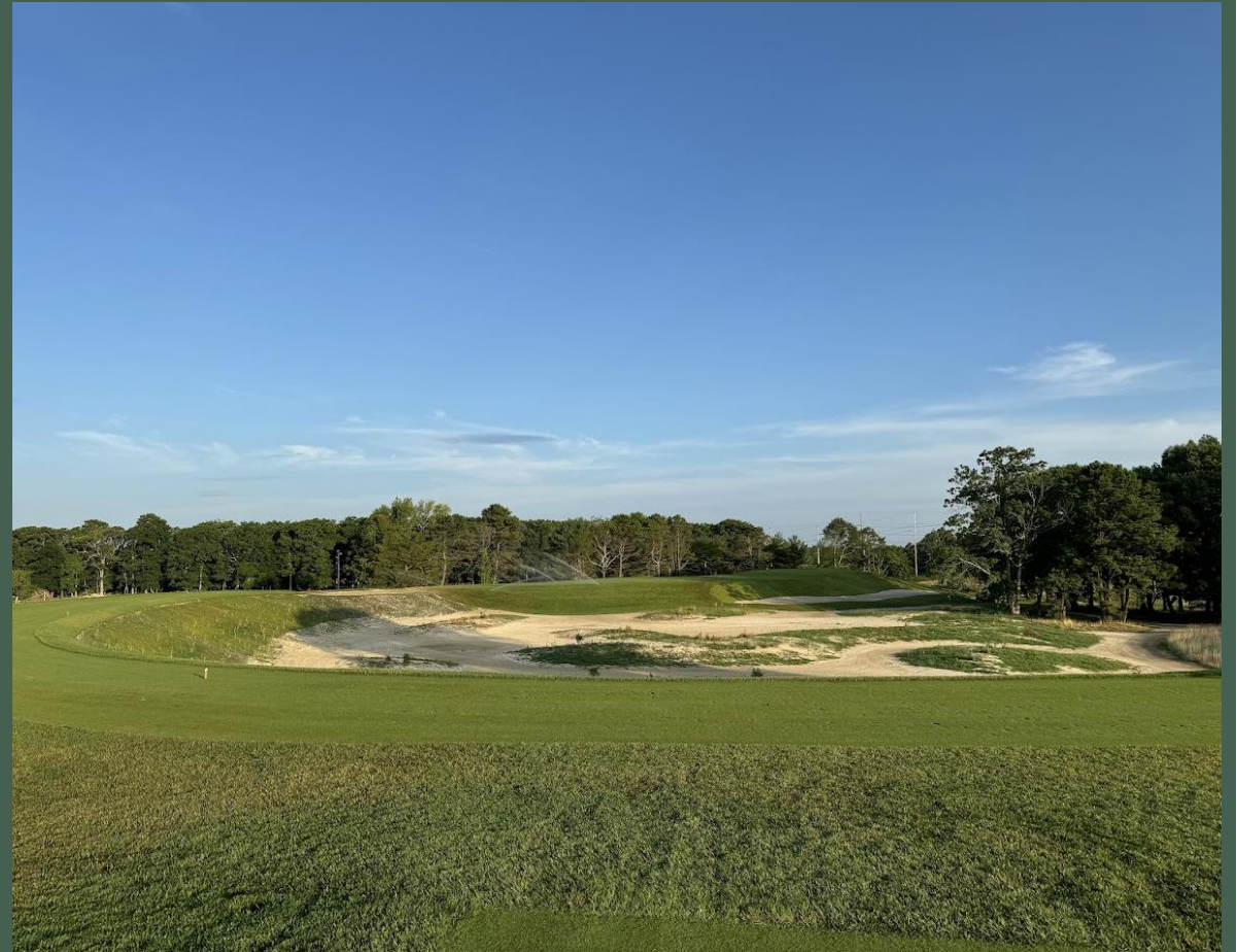
#4 waste area- 2024